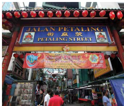
Chinatown (Petaling Street)