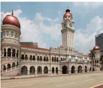
Sultan Abdul Samad Building